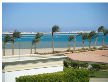
Abu Soma, Egypt