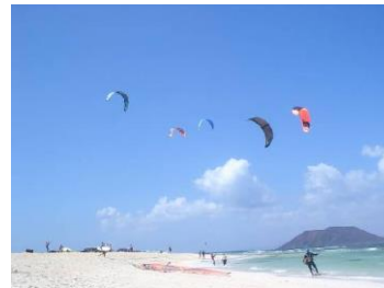
Fuerteventura, Canary Islands