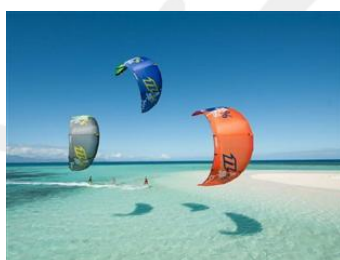
Langebaan, South Africa