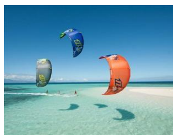
Langebaan, South Africa