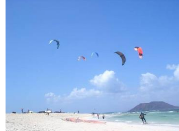
Fuerteventura, Canary Islands