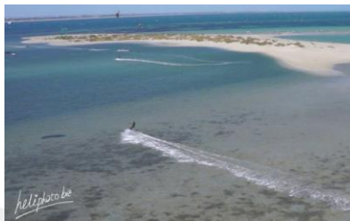
Safety Bay, WA