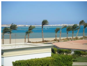
Abu Soma, Egypt