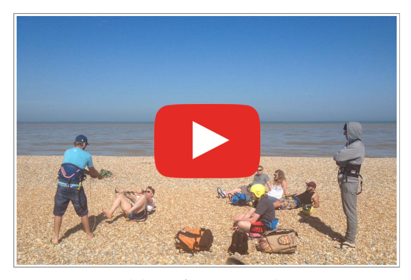
Click Here for Instructor Video

Rather than us telling you why you'd want to be an instructor we've asked a few of our instructors to make a short video expressing their own thoughts, check them out below.